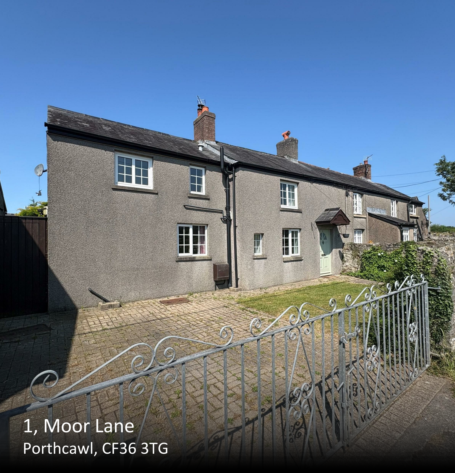
1, Moor Lane Porthcawl, CF36 3TG